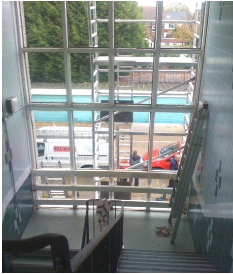
School Lane - new windows at last!