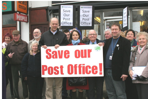
Saving post offices—we're fighting for all our local services