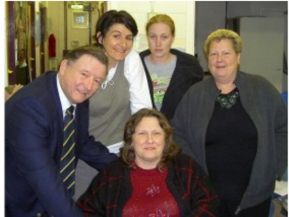
Awards to keen gardeners—every leaf really does count!