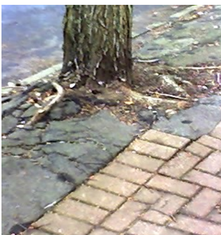
Roads and pavements need maintaining—we got this done and we're working on more!